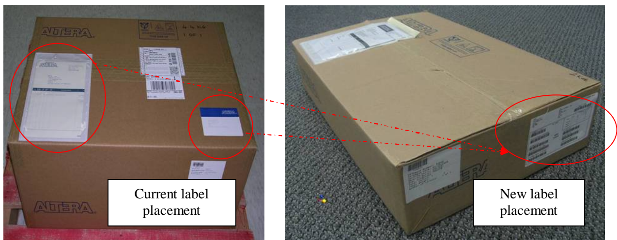
Figure 1. Placement of the current and new outer shipping carton labels.

The new label and location improve access to shipping and product information, see Figure 1. Information on the new shipping label complies with the EIA-556 (Electronic Industries Alliance) Outer Shipping Bar Code Label Standard. All information on the current label is contained on the new label, see Figure 2.